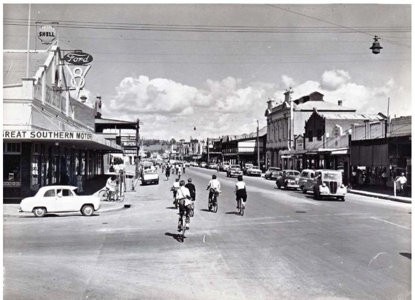
Baylis Street, Wagga Wagga in the early 1950's

We hope to see you at the 15 th Hillman National Rally.